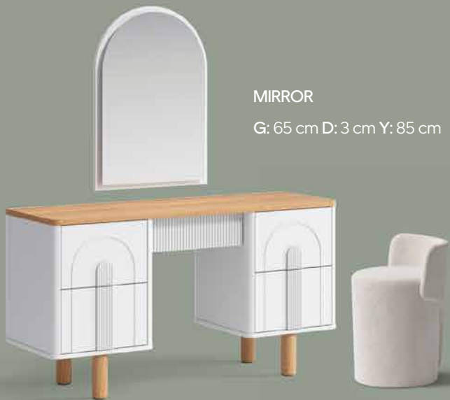
DRESSER W: 148cm D: 47 cm H: 80 cm MIRROR G: 65 cm D: 3 cm Y: 85 cm POUF W: 41 cm D: 43 cm H: 57 cm