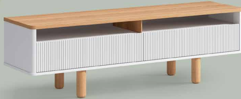
TV UNIT W: 182 cm D: 48 cm H: 55 cm