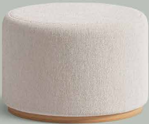
POUF W: 55 cm D: 55 cm H: 30 cm