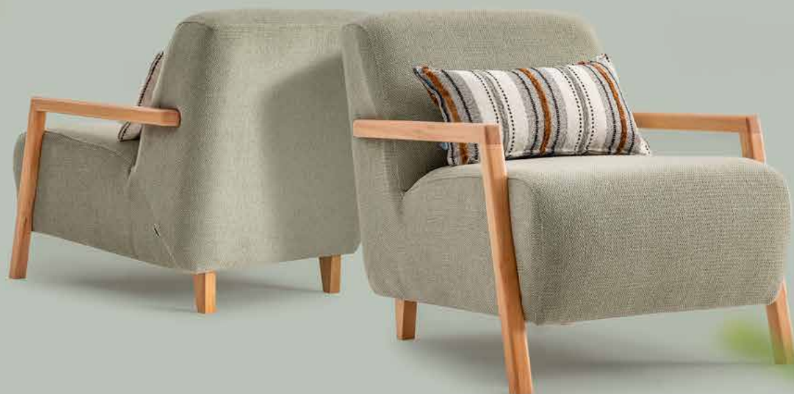
BERGERE W: 71 cm D: 99 cm H: 80 cm