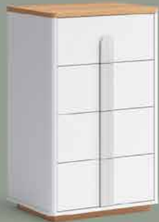
CHEST OF DRESSER W: 65 cm D: 47 cm H 102 cm