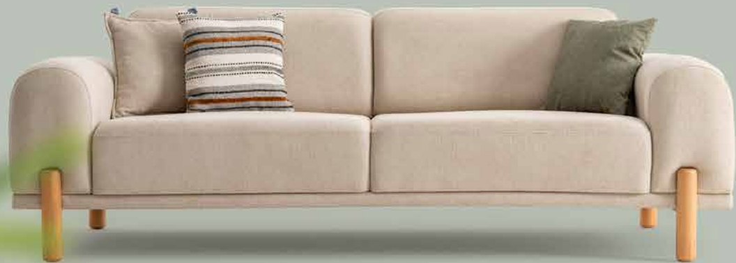
3 SEATER SOFA W: 235 cm D: 104cm H 84 cm Bed Size: 175 x 100 cm