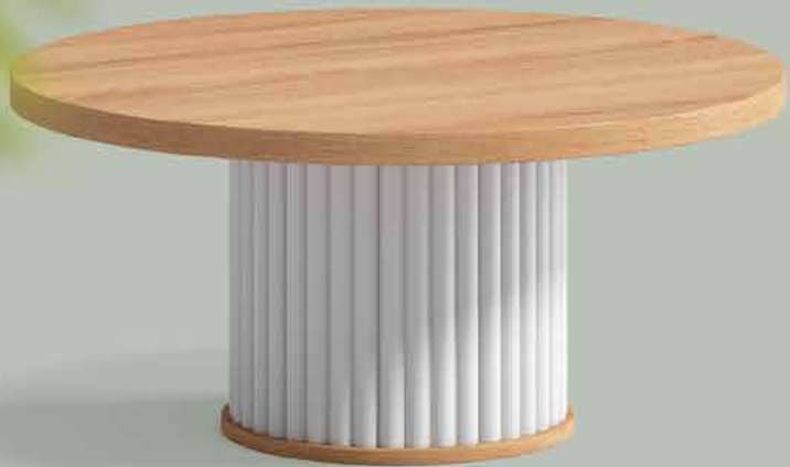
COFFE TABLE W: 90 cm D: 90 cm H: 42 cm