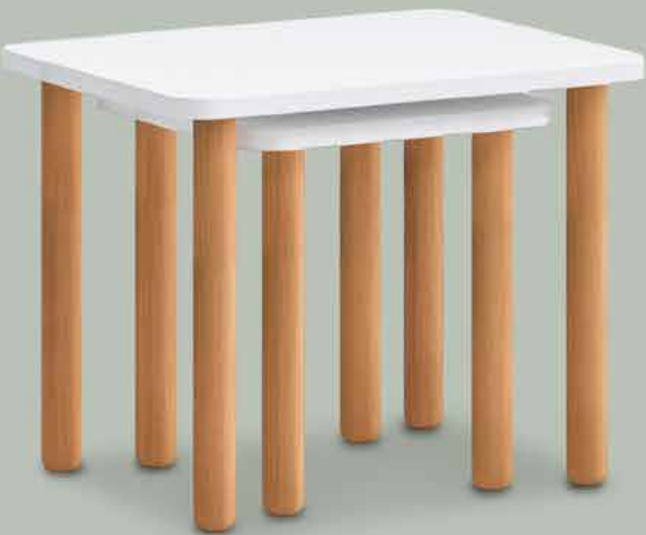
NESTING TABLE W: 65 cm D: 50 cm H: 51 cm