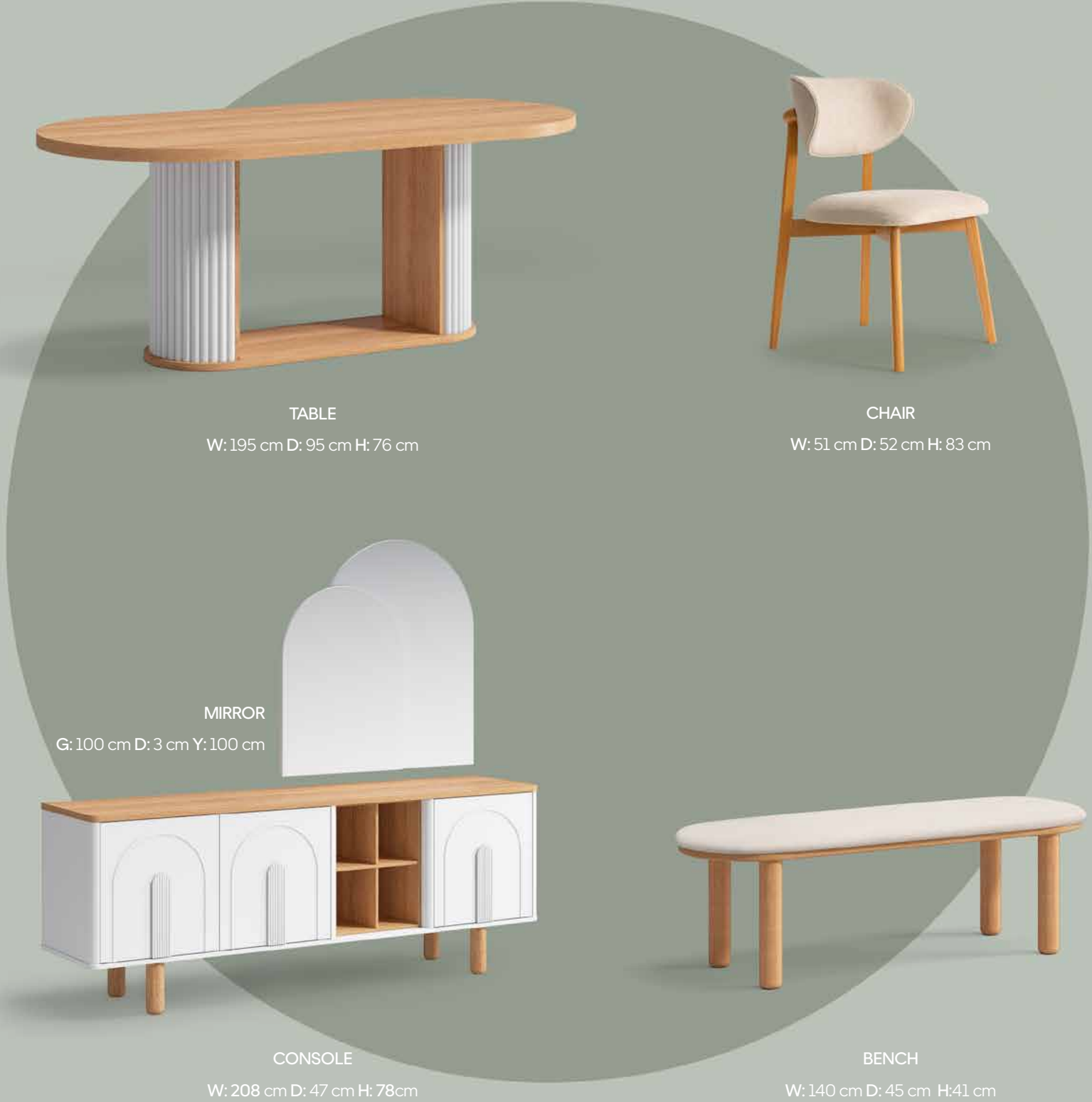
TABLE W: 195 cm D: 95 cm H: 76 cm