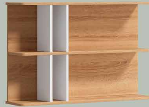
UNIT UPPER BLOCK W: 108 cm D: 24 cm H: 71cm