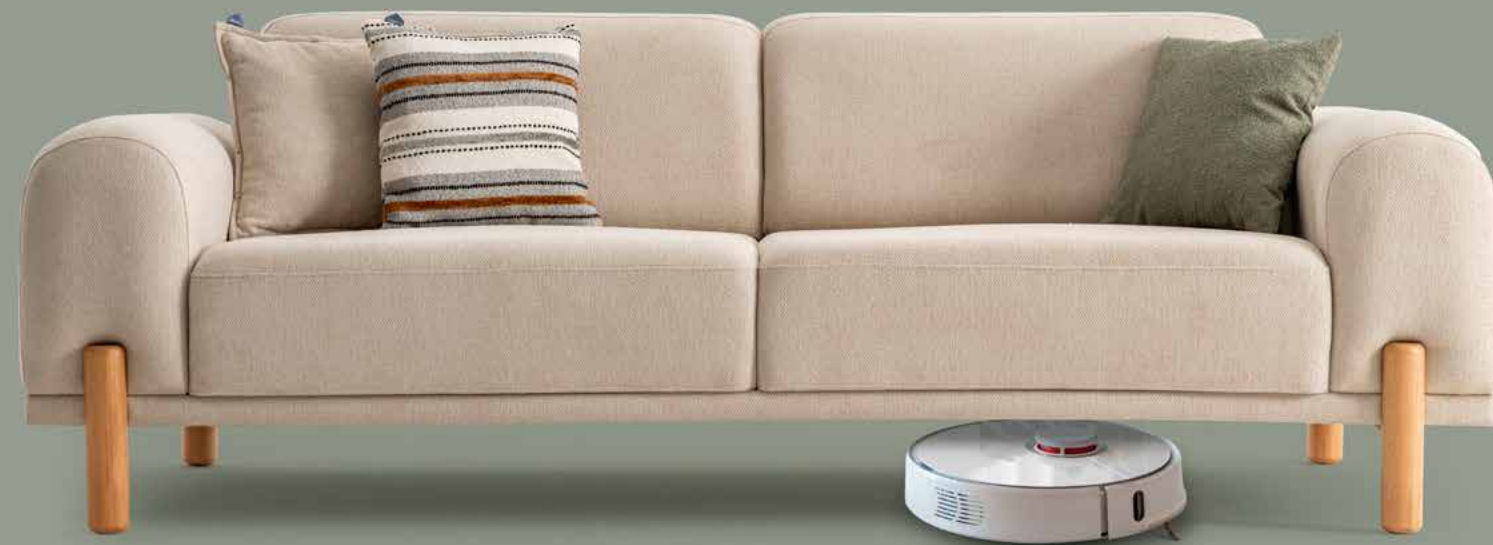
Compatible with cleaning and robot vacuum