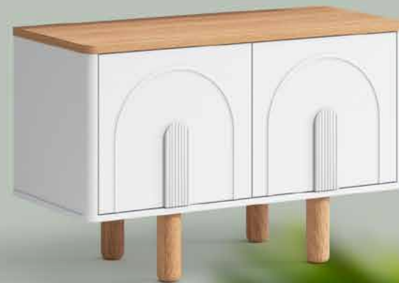
UNIT SIDE BLOCK W: 108 cm D: 48 cm H: 78 cm