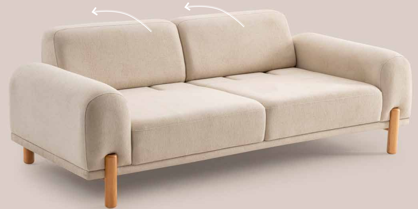
Single Bed & Tv Session

It consists of basement, triple, double and wing chair modules. Wipeable, woven fabric is used for upholstery. Feather sponge on 32 danste, medium soft sponge is used in the sessions; feather sponge is used in the arm and back interiors. Thanks to the mechanism used, the back parts of Bodrum can be opened backwards and it can be used as a single bed and TV session. Natural dried wood is used in the triple legs and armrests of Bodrum. The high legs provide convenience in robot vacuum cleaner use and daily cleaning.